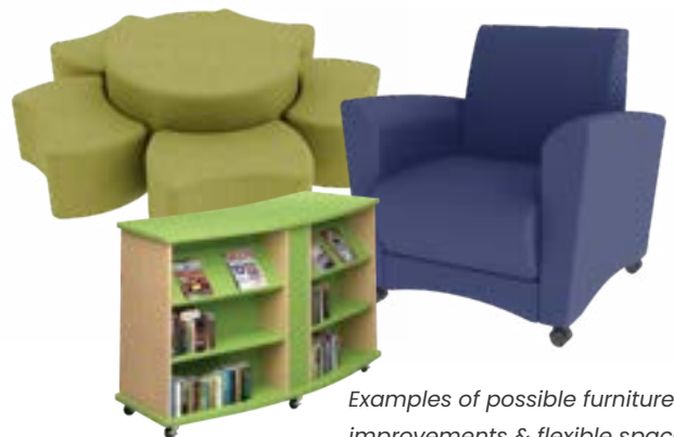
Examples of possible furniture improvements & flexible spaces